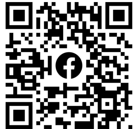
QR code for Washoe County Foster & Adoption Support Facebook group